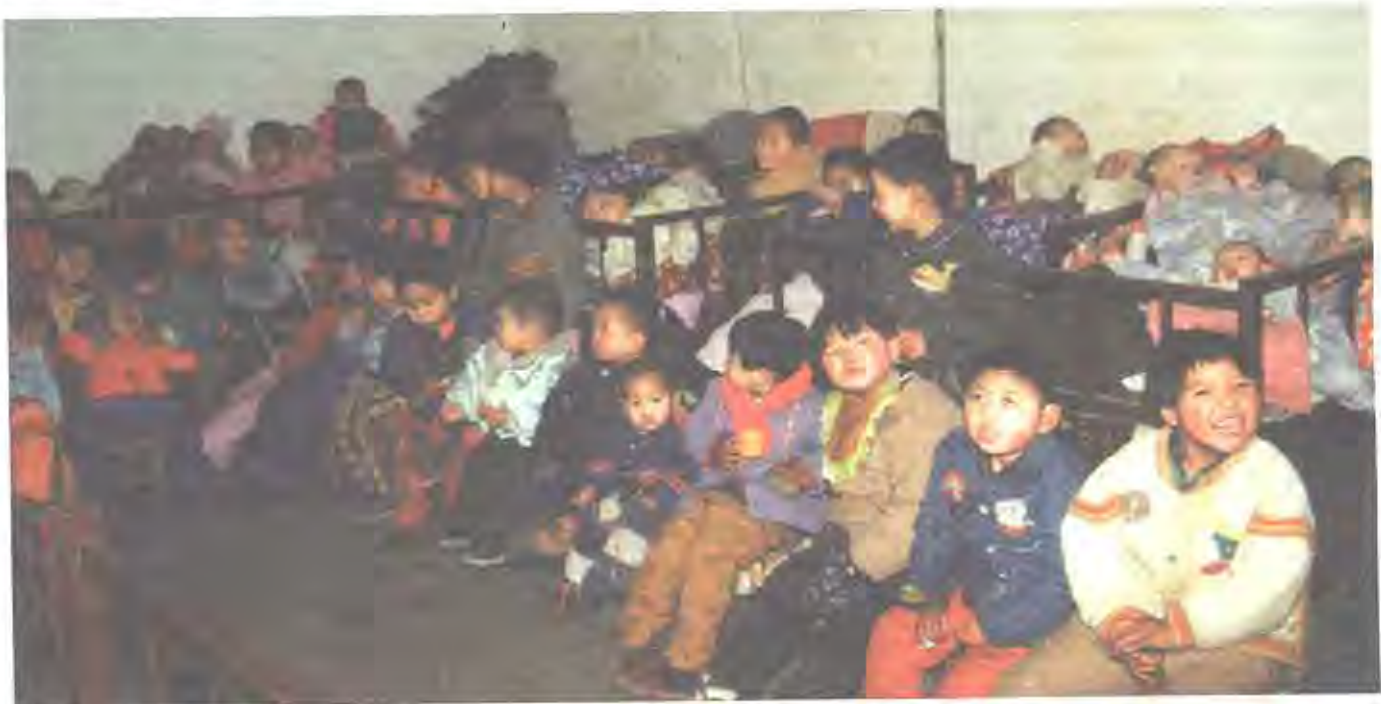
Underground Orphanage For Eighty Babies And Children In Need Of Help

About 80 babies and children aged from several months to early teens are now under care of this gentleman who is assisted by about 50 volunteers. They are desperately in need of financial help to buy food and medicine. Each child needs only one U. S. dollar a day, or $ 30 a month, for food. In addition, they need medicine and improvements in their lodging facility as you can see in the picture below. The building is desperately in need of repair and of more space. We are privileged to be called upon for help and have sent them some emergency money.